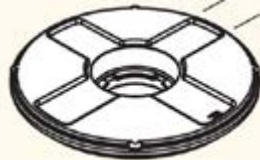
LH_F Flat Head

Breaking off all the tabs can be time consuming, if you definitely do not need them, simply purchase these flat heads and exchange the standard tabbed heads with these ones.